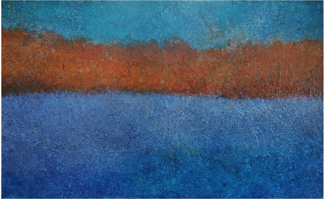
Russ Cox 'Alatus' Oil on Canvas 60" x 36" $6500