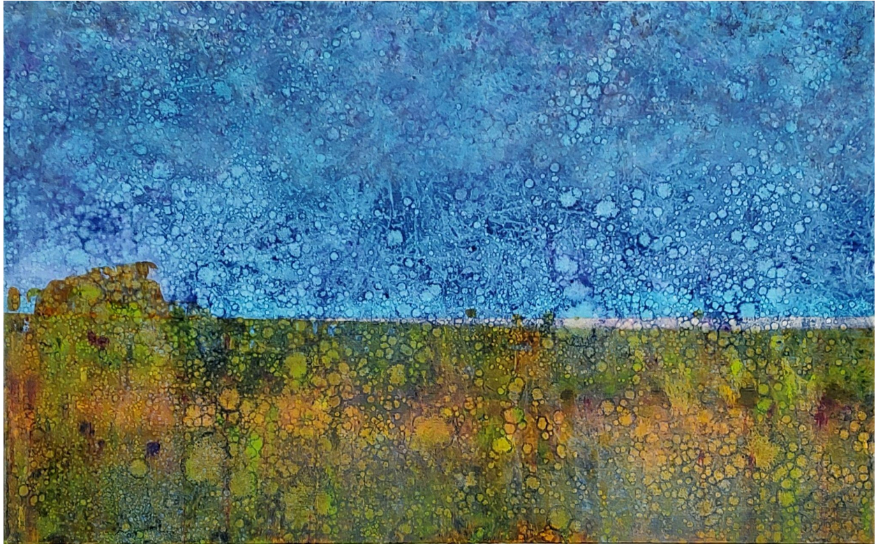
Russ Cox 'Reid State Park' Oil on Canvas 48" x 30" $4200