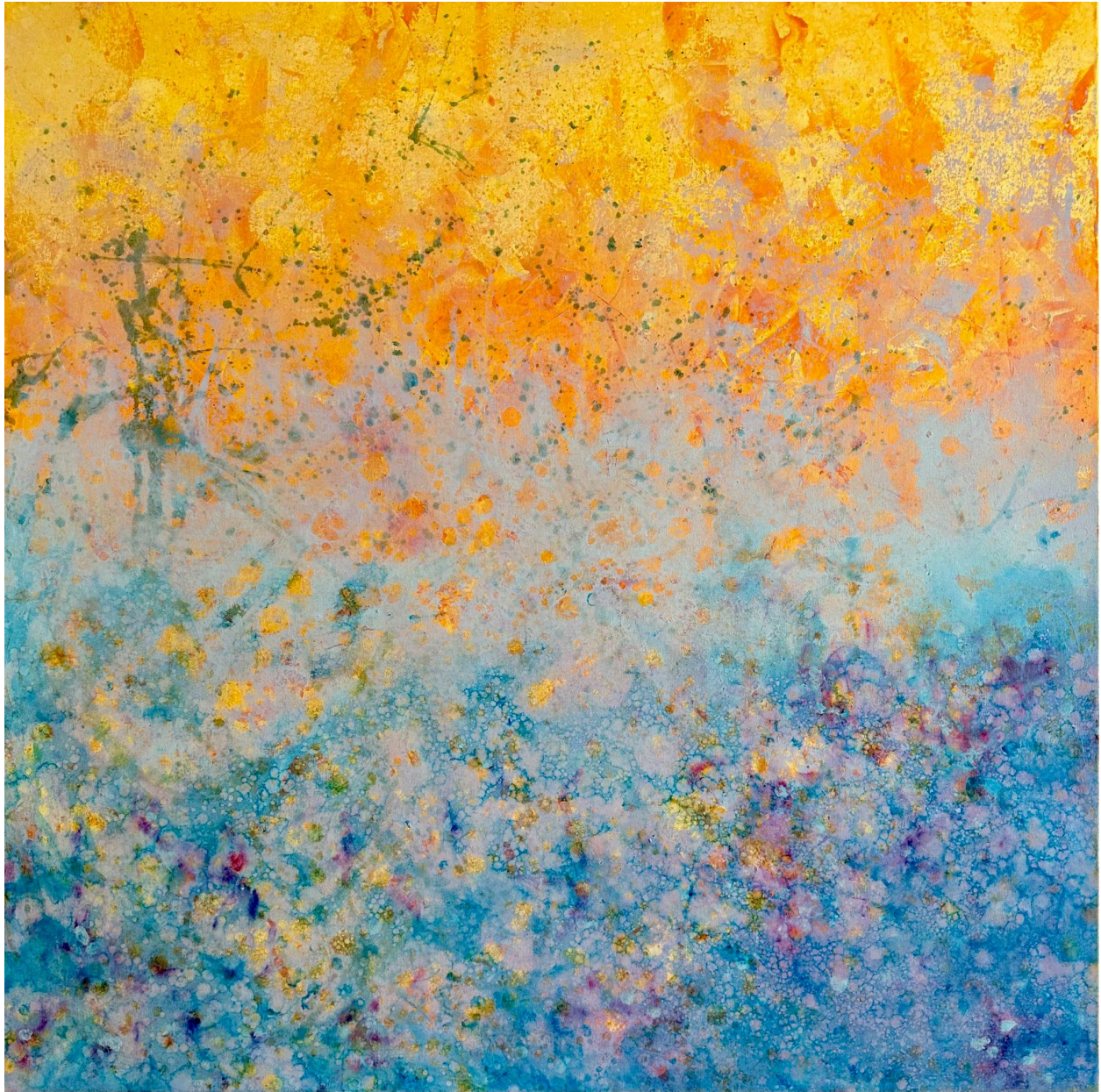
Russ Cox 'Spring Light' Oil on Canvas 40" x 40" $4900