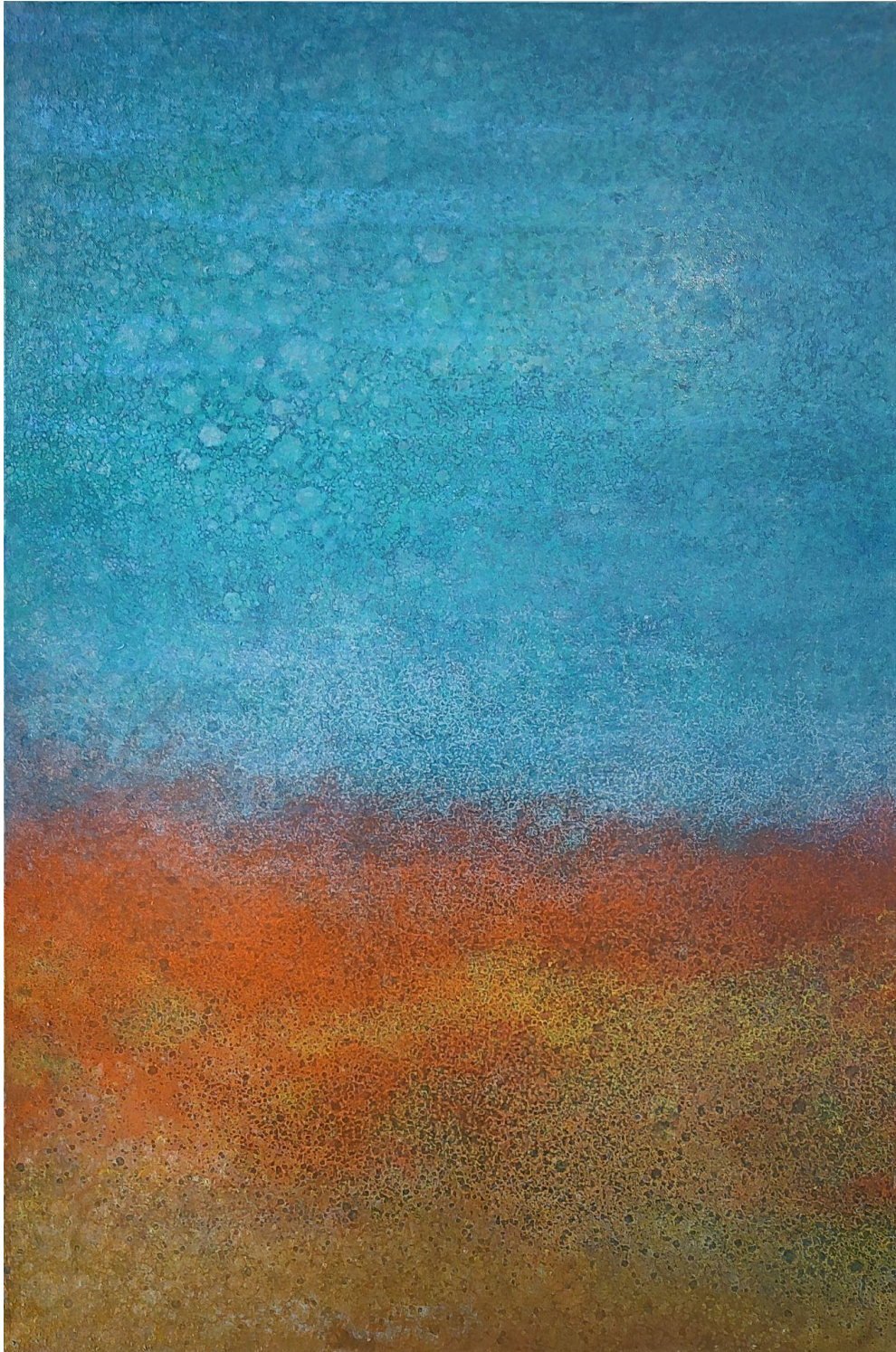
Russ Cox 'The Bluff' Oil on Canvas 24" x 36" $3200