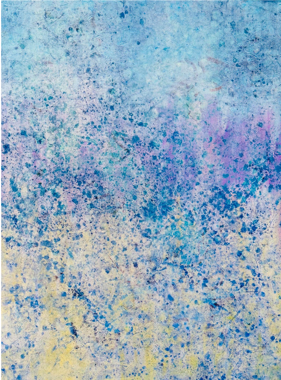
Russ Cox 'Lupin' Oil on Canvas 36" x 48" $5800