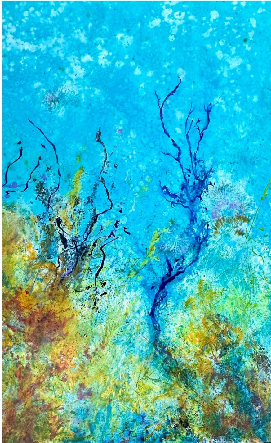
Russ Cox 'Casco Bay Rockweed' Oil on Canvas with Handcrafted Spalted Wood 59" x 98" $9500