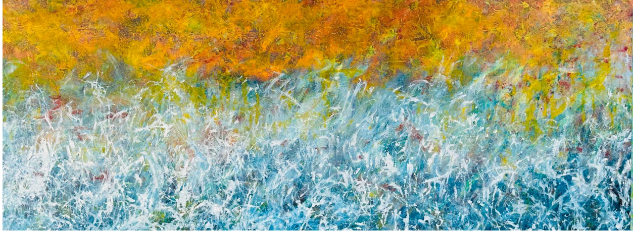
Russ Cox 'Upper Field' Oil on Canvas 96" x 36" $9500