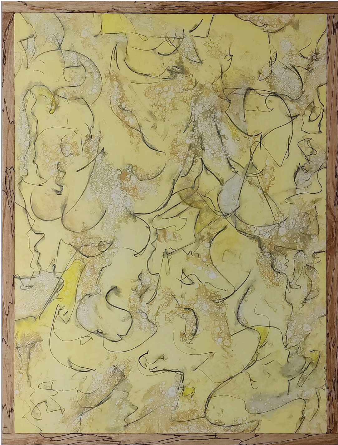
Russ Cox 'All The Places You'll Go' Oil on Canvas with Handcrafted Spalted Wood 39" x 51" $7200