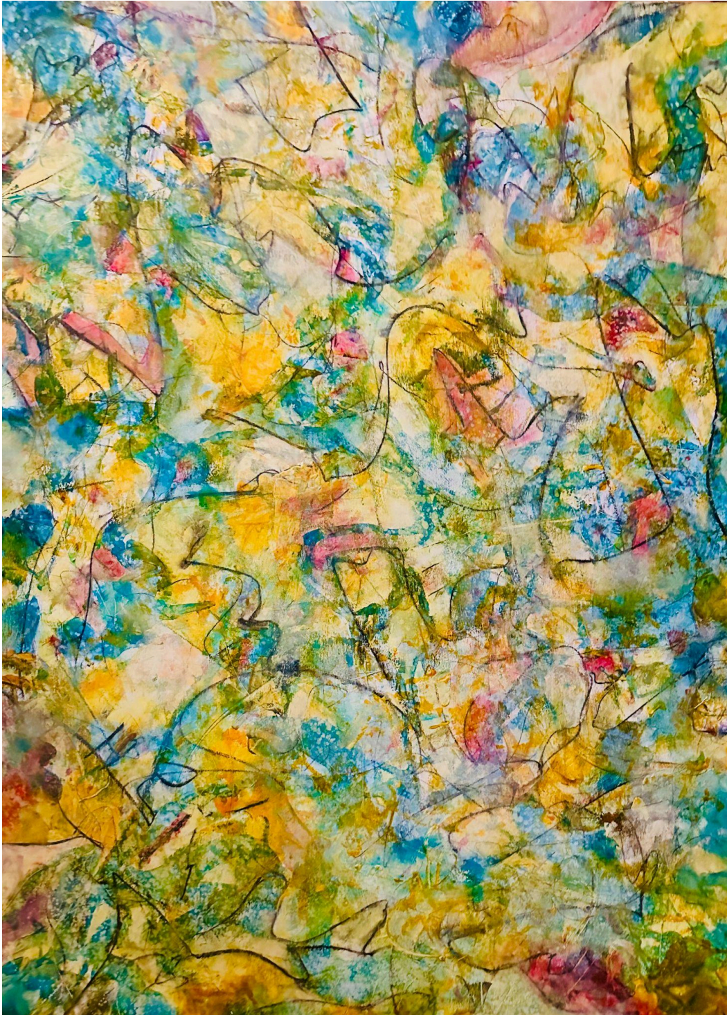
Russ Cox 'Pollen Tracks' Oil on Canvas 36" x 48" $5200