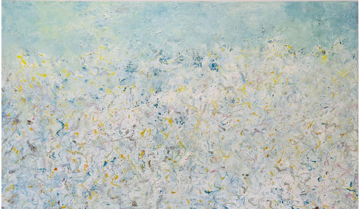
Russ Cox 'Lower Field' Oil on Canvas 60" x 36" $6500