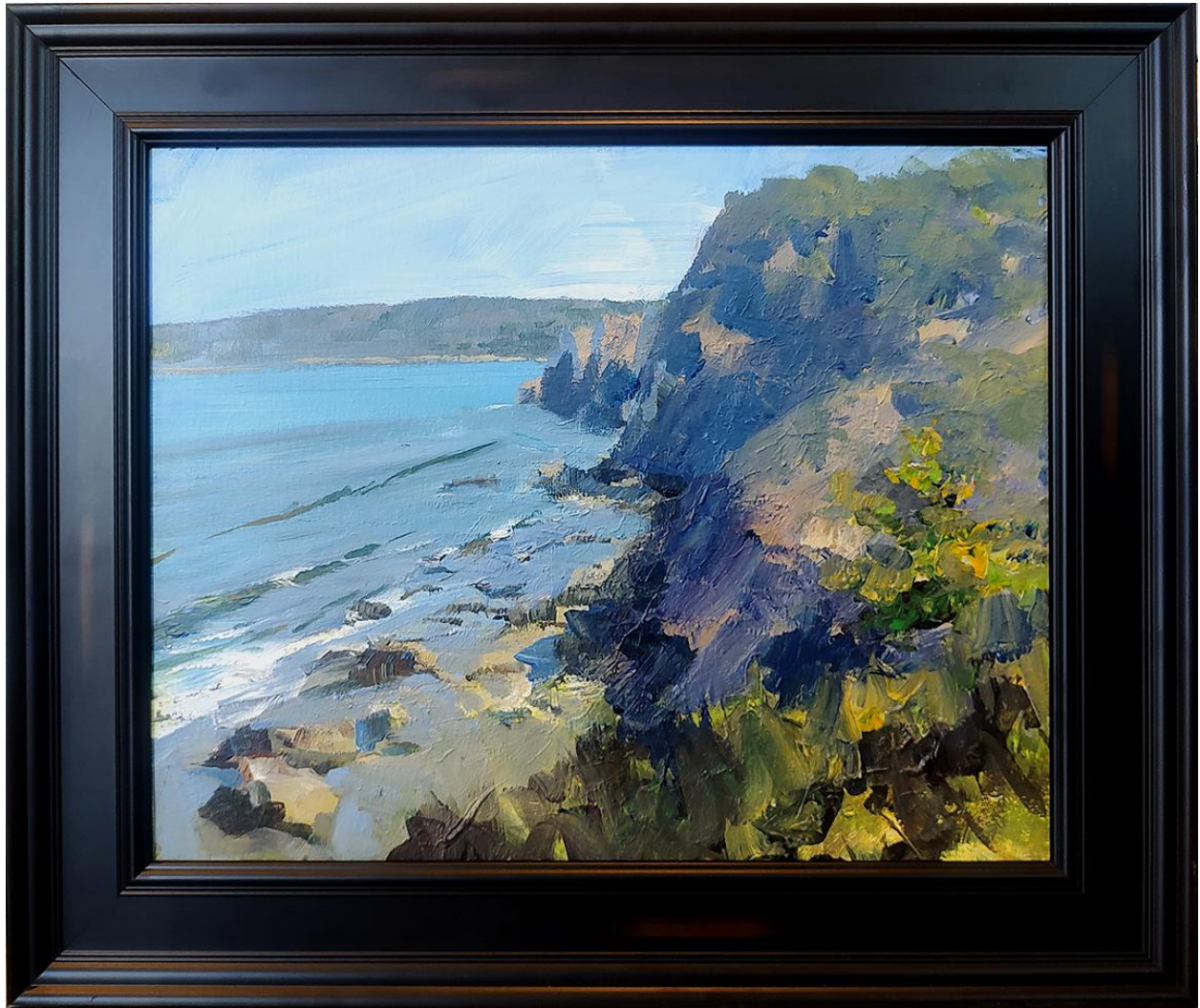
Paul Brahm's 'Cliff Bound' Oil on Canvas 21.5" x 25.5" $3900