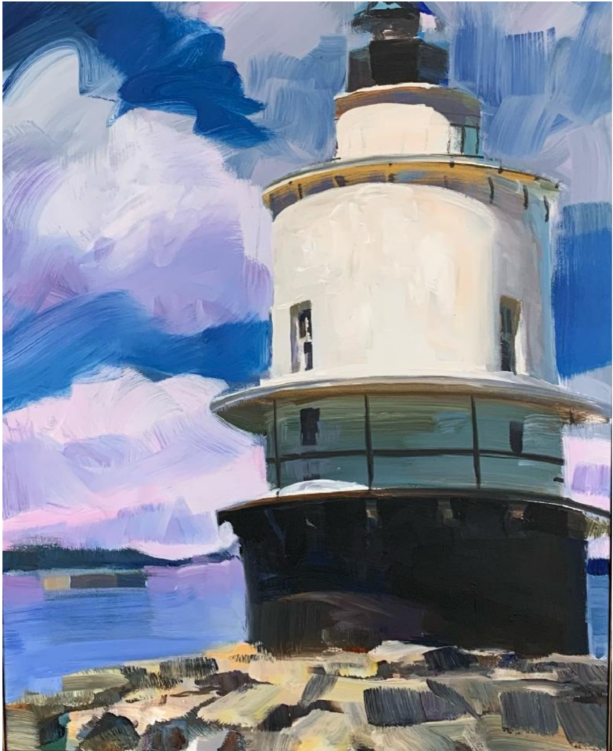
Paul Brahm's 'Bug Light' Oil on Canvas 25.5"×32 $3800