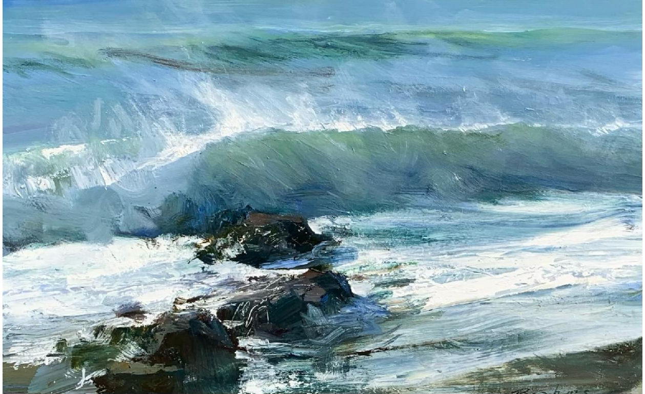
Paul Brahms 'Spray' Oil on Canvas 48" x 30"

It wouldn't be summer in Maine without stunning new paintings of the iconic Maine coast by master artist Paul Brahms. Brahms is a master painter with a brush and pallet knife. With simple strokes, he captures details and emotion. His sense of color is that of someone who has spent a lifetime looking and letting the colors reveal themselves with all of their depth and nuance.