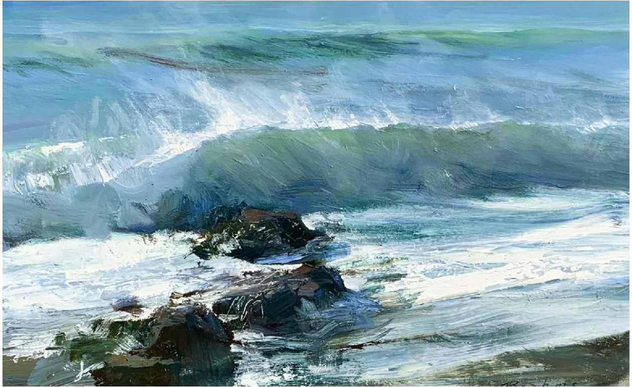
Paul Brahm's 'Spray' Oil on Canvas 48" x 30" $8700