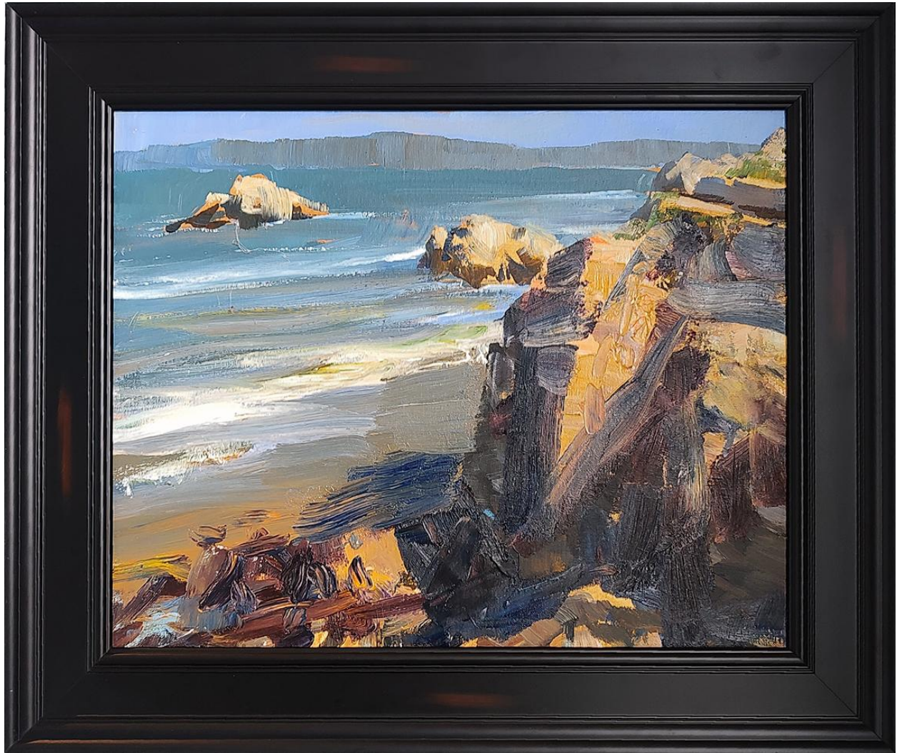
Paul Brahm's 'Rocky Coast' Oil on Canvas 21.5" x 25.5" $3900