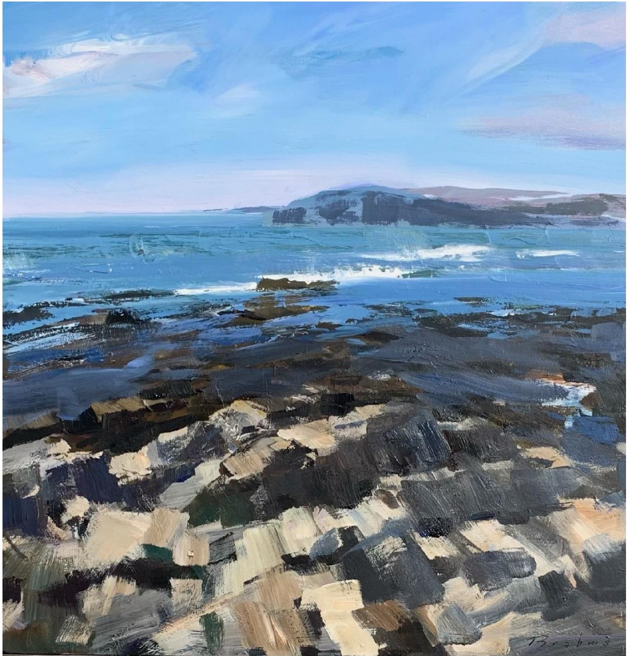
Paul Brahm's 'Island View' Oil on Canvas 50" x 50" $7500