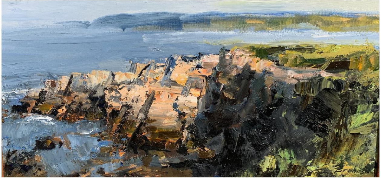
Paul Brahm's 'On Cape E' Oil on Canvas 25" x 13" $4400