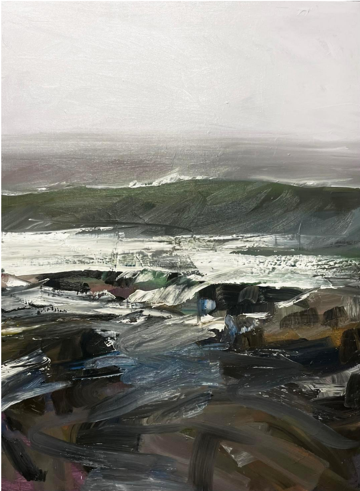
Paul Brahm's 'Before the Storm' Oil on Canvas 27.5"x37.5" $5200

68 Commercial St., The Maine Wharf, Portland, Me 04101 | 207 · 536 · 1577 | cascobayartisans.com