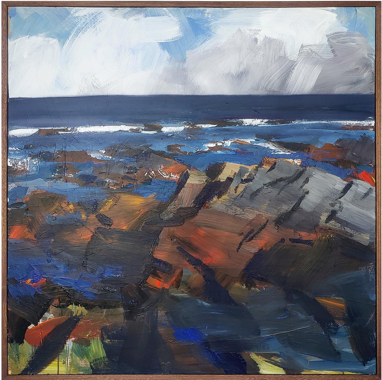
Paul Brahm's 'Twilight' Oil on Canvas 50" x 50" $6500