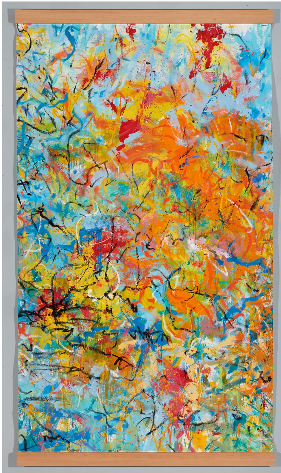
Russ Cox 'Party On The Wharf' Oil on Canvas Scroll 48"x80" $6,200

68 Commerical St., The Maine Wharf, Portland, Me 04101 | 207 · 536 · 1577 | Cascobayartisans.com