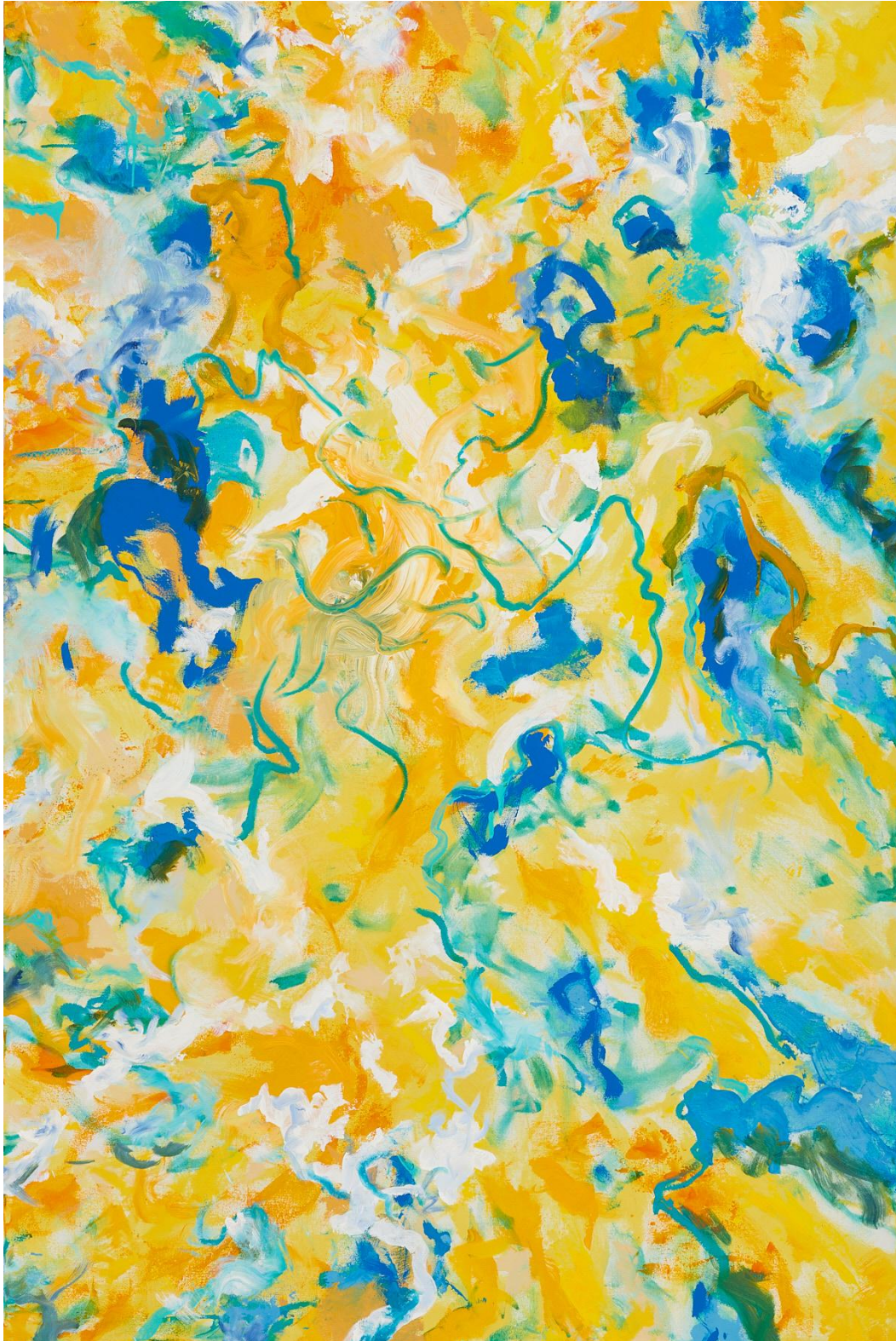
Russ Cox 'Marseille' Oil on Canvas 48"x72" $9,500

68 Commerical St., The Maine Wharf, Portland, Me 04101 | 207 · 536 · 1577 | Cascobayartisans.com