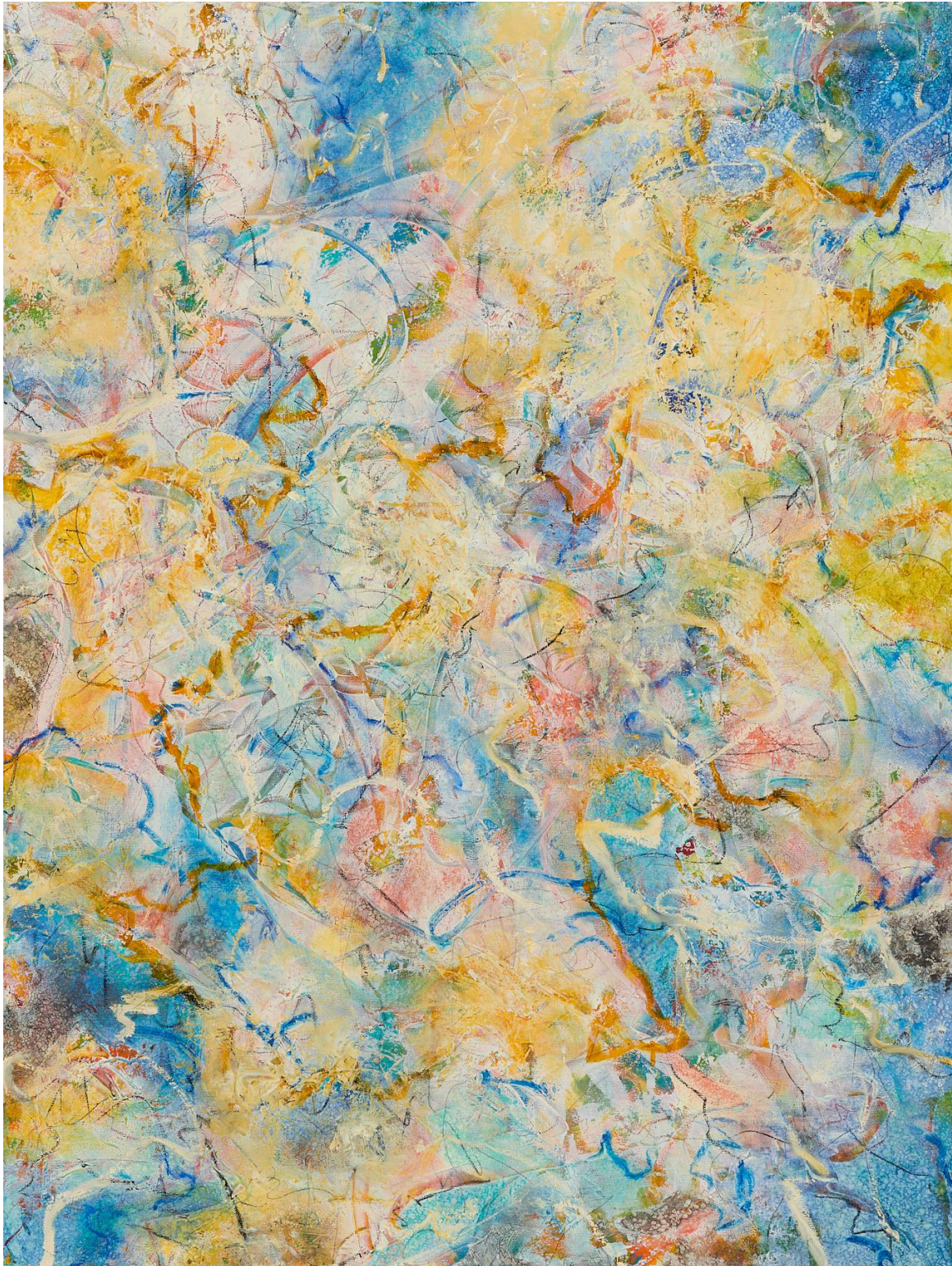
Russ Cox 'Uncovered Oil on Canvas 48"x36" $4,200

68 Commerical St., The Maine Wharf, Portland, Me 04101 | 207 · 536 · 1577 | Cascobayartisans.com