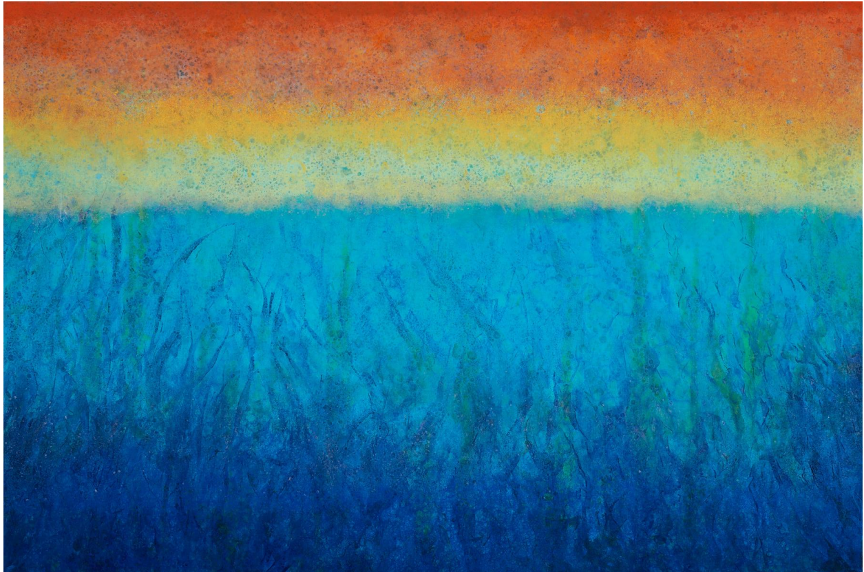
Russ Cox 'Moment' Oil on Canvas 48"x72" $6,800