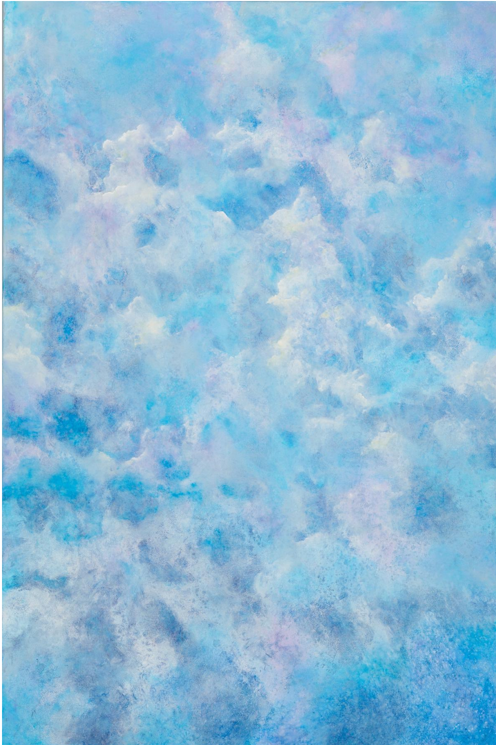
Russ Cox 'Clouds' Oil on Canvas 40"x60" $5,200