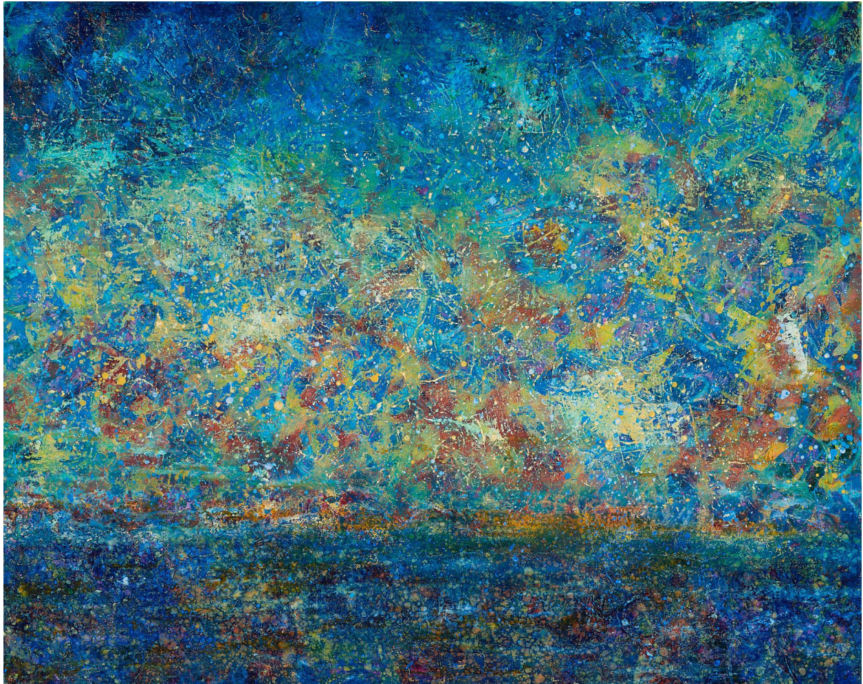
Russ Cox 'Finale' Oil on Canvas 48"x60" $5,200