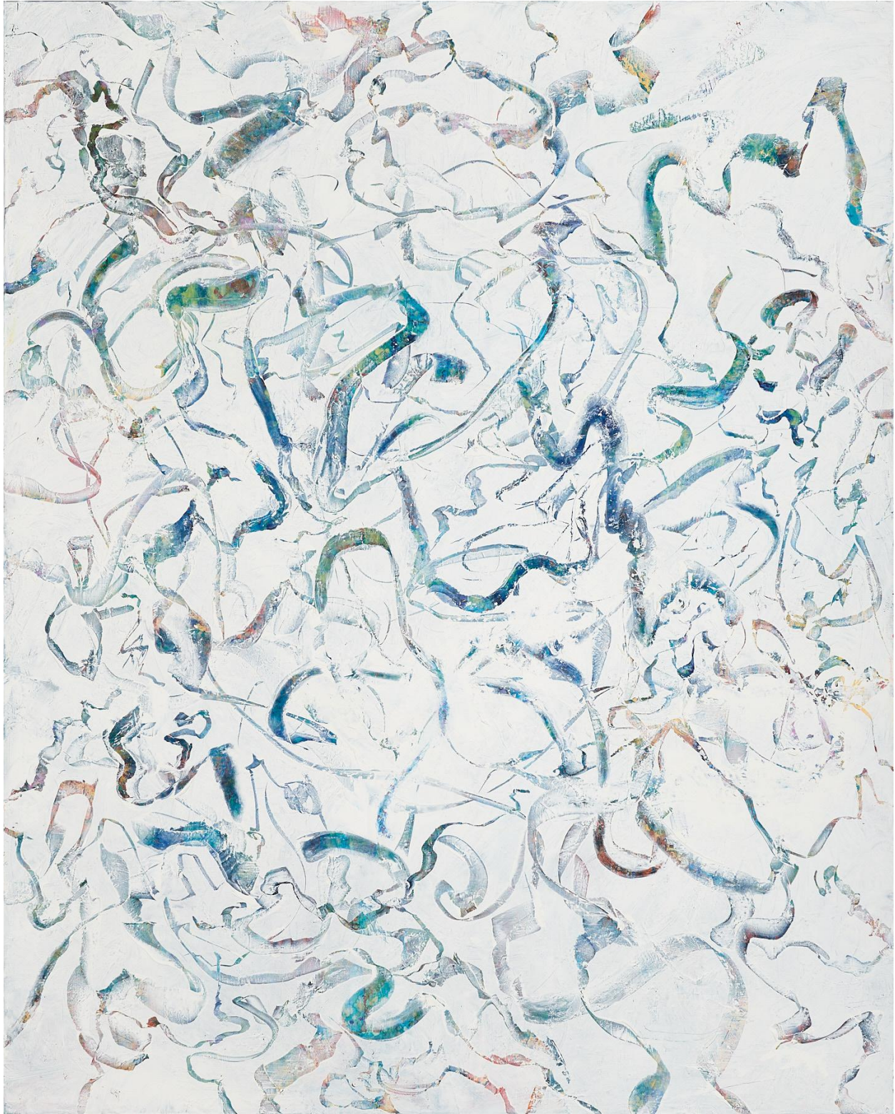
Russ Cox 'Dance' Oil on Canvas 48"x60" $5,200