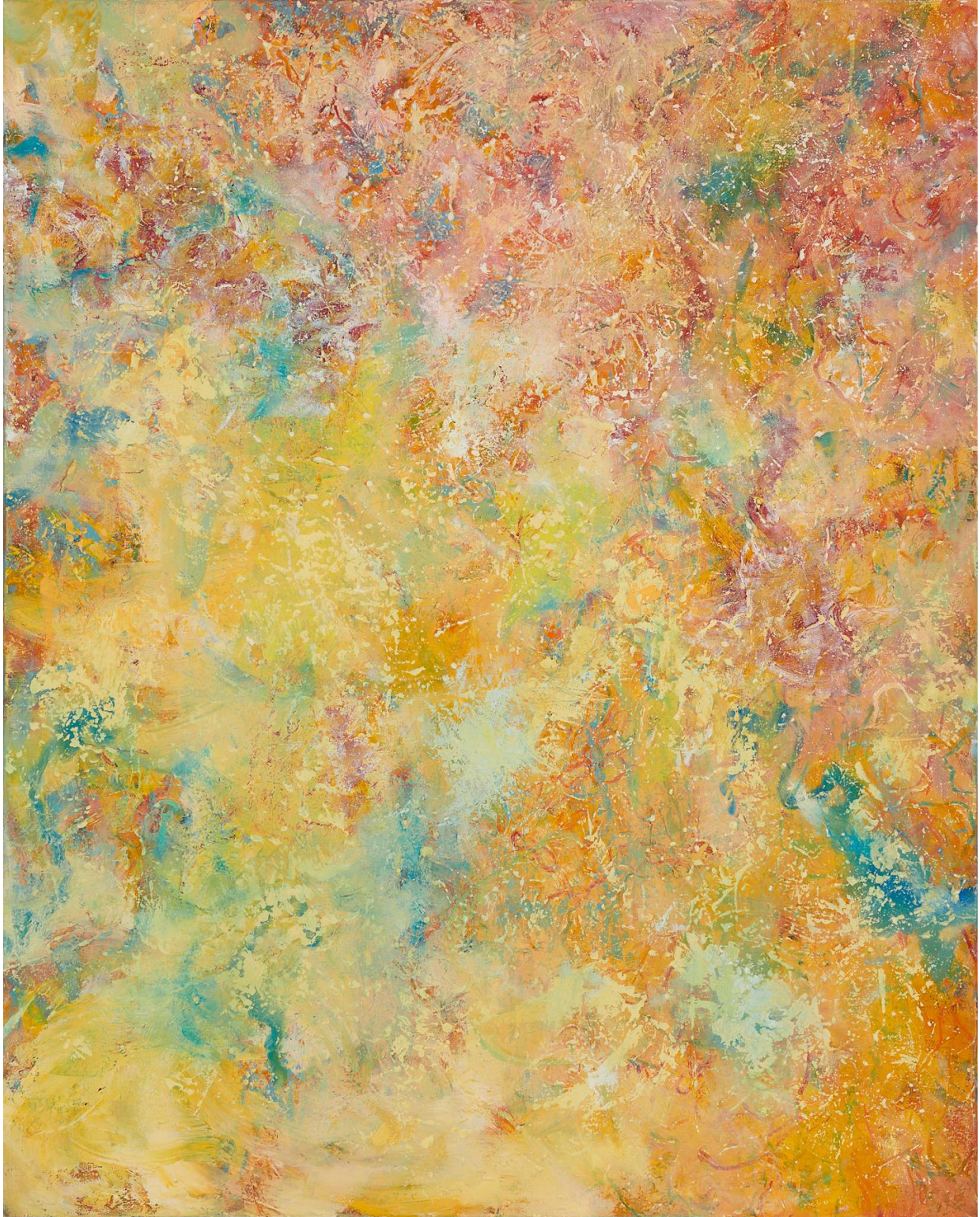
Russ Cox 'Sunspot' Oil on Canvas 48"x60" $5,400

68 Commerical St., The Maine Wharf, Portland, Me 04101 | 207 · 536 · 1577 | Cascobayartisans.com