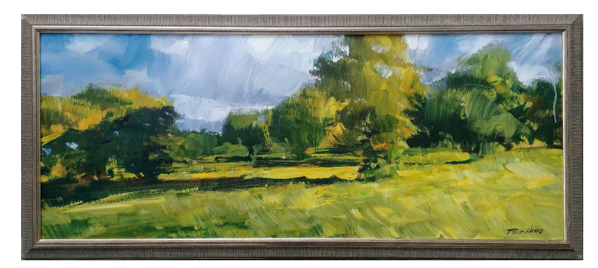
Paul Brahms Light Through the Trees Oil on Panel 43"x19" $3,800