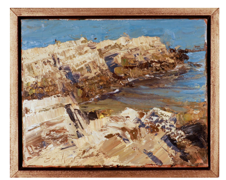
Paul Brahms 'Tide Pool' Oil on Canvas 11.5"x9.5" $1,100