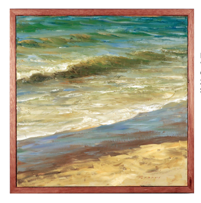
Paul Brahms 'Beach Waves' Oil on Canvas 26"x26" $1,716