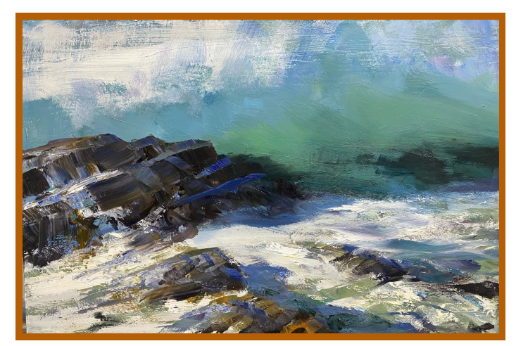
Paul Brahms 'Rolling In' Oil on Canvas 36"x24" $5,800