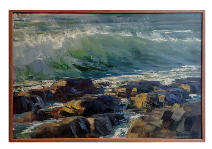
Paul Brahms 'Wave Study' Oil on Canvas 38"x24" SOLD