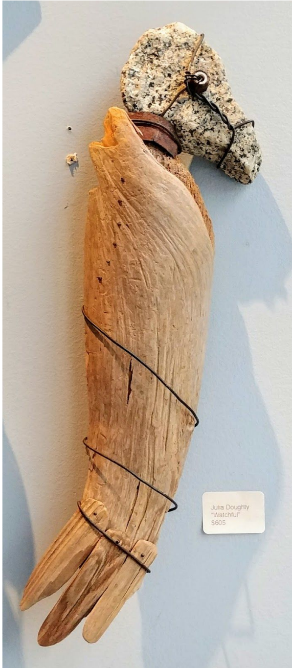
Julia Doughty Watchful Found Objects $605