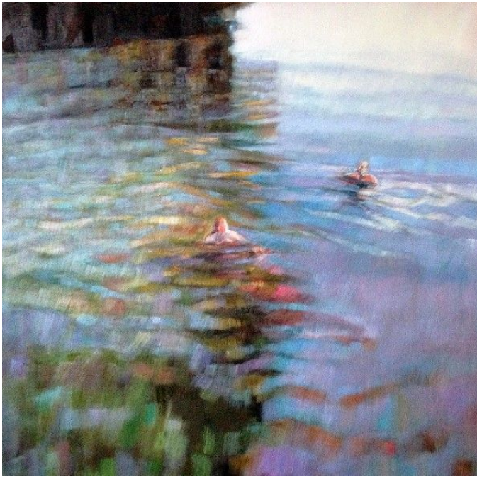
Britta Bruce Slip Away Oil on Canvas 36"x36" $3,740